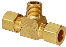
Male Branch Tee