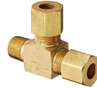
Male Run Tee