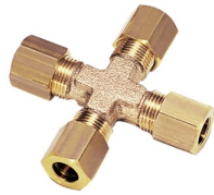
Cross Brass Union