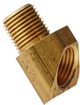
45° Male Elbow