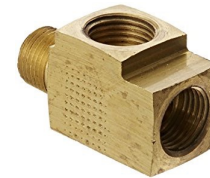
Male Run Tee