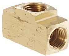
Female Branch Tee