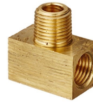
Male Branch Tee