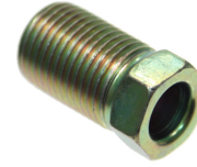
Long Tube Nut